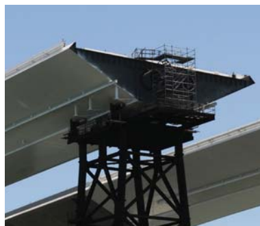
Our scales have the same orthotropic design used for many high-traffic roadway bridges.

When a highway bridge fails, the results can be catastrophic. Many bridge designers are now turning to orthotropic ribs as a better alternative to older support structures because of the proven strength, reliability, and longevity. Give your weighbridge the same durable orthotropic design that is being used for today's highway bridges. Don't let a failed weighbridge be catastrophic for your business.