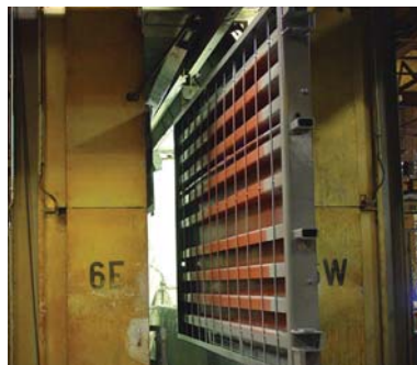
Metal surfaces are coated with a two-part epoxy finish to protect against corrosion.

The end result is a durable finish that protects against the corrosion and contaminants that can shorten the life of a scale.