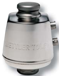
POWERCELL PDX Load Cell

As the global leader in weighing, we offer a full line of truck scales and accessories to meet your weighing needs. Only one line of truck scales is accurate enough, reliable enough, and durable enough to carry the METTLER TOLEDO name.